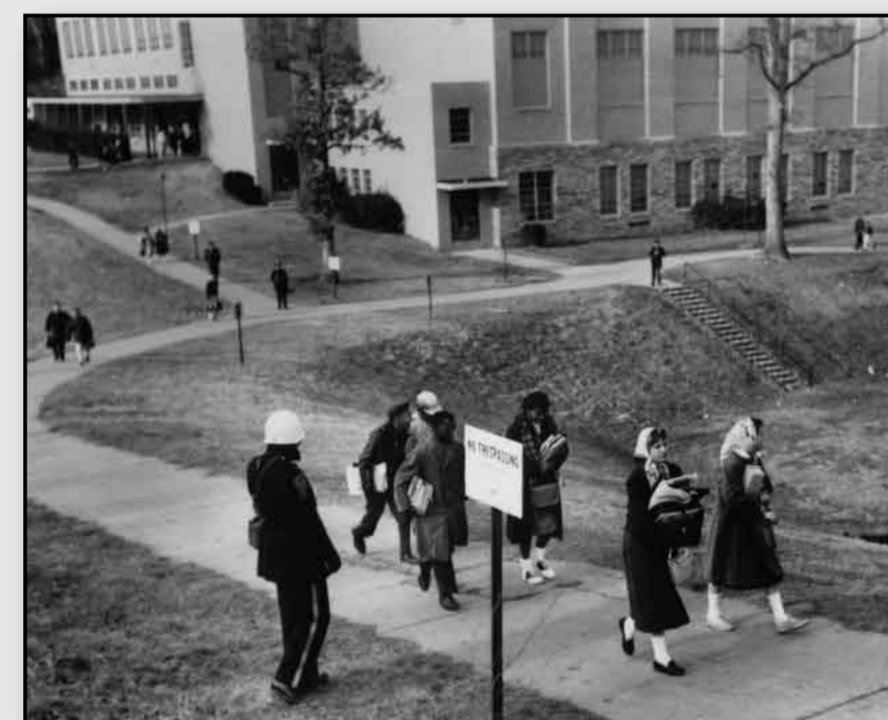
First Day of Integrated Classes

Edmund D. Campbell died on December 7, 1995, in Arlington. Following his death, The Washington Post stated: "In life, as in court, Ed Campbell fought injustice with a passion, insisting that freedom be accorded citizens without regard to color or belief."