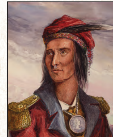
Native American leader Tecumseh

In 1811, when Tecumseh was in the South, a group of natives led by Tenskwatawa, attacked U.S. army forces in the Battle of Tippecanoe. The battle was a draw, but the U.S. General William Henry Harrison declared victory and then had his troops sack and burn Prophetstown, Tecumseh's home base in the Indiana territory. Following the Tippecanoe defeat, Tecumseh realized even more how important it was for a British alliance.