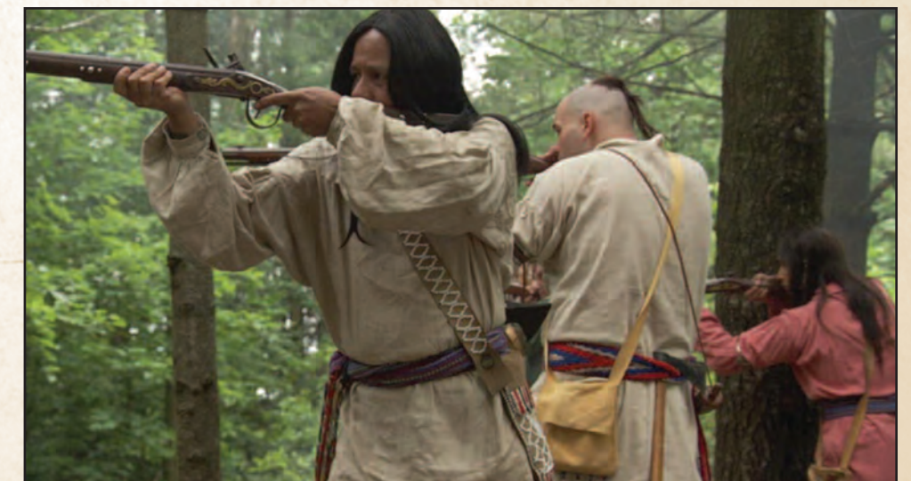
Native American re-enactor.