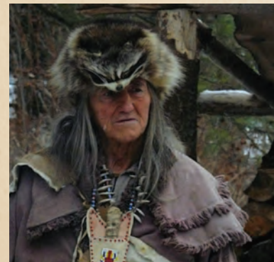
Native American reenactor.

The Native leaders who emerged in response to this expansion shared a single concern, that of protecting tribal lands. There were Indians who sided with the Americans — Red Jacket and