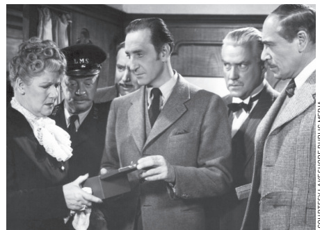
Basil Rathbone stars as Sherlock Holmes and Nigel Bruce portrays Dr. John Watson