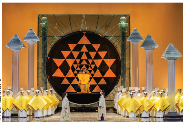
Mozart’s The Magic Flute airs Dec. 21