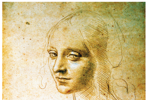
LEONARDO DA VINCI, STUDY FOR ANSEL OF THE VIRGIN OF THE ROCKS, CIRCA 1479-1485.