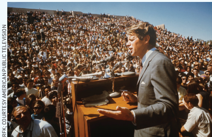
RFK

Three acclaimed WETA productions spotlight the national capital area in the 1980s, 1990s and 2000s and feature the reflections of prominent local figures. The “Decades” series explores the years of Reagan and Barry, the Vietnam Veterans Memorial Wall, The Quilt, Go-Go and DC punk, the Air Florida crash, a golden age for local media and sports; the revitalization of downtown D.C. and the region’s emergence as a technology hub; and the 9/11 terrorist attack, the D.C. sniper, the return of Major League Baseball, the emergence of a local foodie scene, and much more. The programs repeat Dec. 12, 8-11 p.m. and Dec. 14, 2-5 p.m. on WETA Metro.