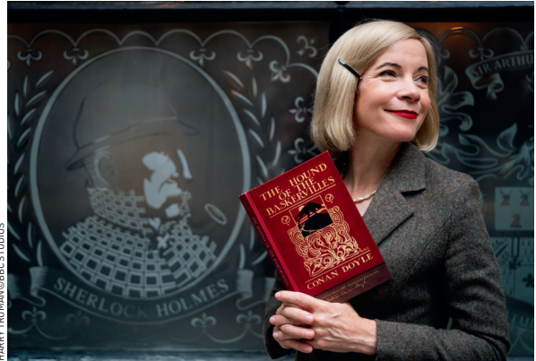
Historian Lucy Worsley explores why author Arthur Conan Doyle came to dislike his most famous creation, Sherlock Holmes

This month on WETA PBS, enjoy several classic and contemporary Sherlock Holmes drama presentations based on Doyle's stories and characters, including the Emmy Award-winning Sherlock on Masterpiece episode The Abominable Bride , starring Benedict Cumberbatch (Holmes) and Martin Freeman (Watson) in a story set in Victorian London. The program airs Sunday, Dec. 8, 9:30 p.m.