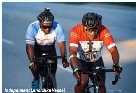
Independent Lens: Bike Vessel

Timings in blue are for both WETA PBS & WETA Metro. Also this month: WETA co-production Making Black America: Through the Grapevine (see page 18) airs Thursdays, Feb. 13 & 20, 9-11 p.m. on WETA Metro; and the landmark series Eyes on the Prize (see page 19) airs Thursdays, 8-10 p.m. on WETA World.