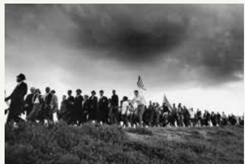
JAMES KARALES; SELMA TO MONTGOMERY MARCH

H enry Hampton's iconic, award-winning 1987 documentary history series shares the human drama of the Civil Rights Movement in America through the experiences and challenges of those fighting for justice. The film tells the story of decades of human rights struggles from the point of view of the ordinary men and women whose extraordinary actions helped to change the fabric of American life. Featuring interviews and rare historical footage, Series 1 traces the Movement from the Montgomery bus boycott in 1954 to the Voting Rights Act in 1965. Julian Bond narrates. Series 2 covers the years 1965 to 1985. Eyes on the Prize won multiple Emmy and Peabody awards and was nominated for an Academy Award for Best Documentary Feature.