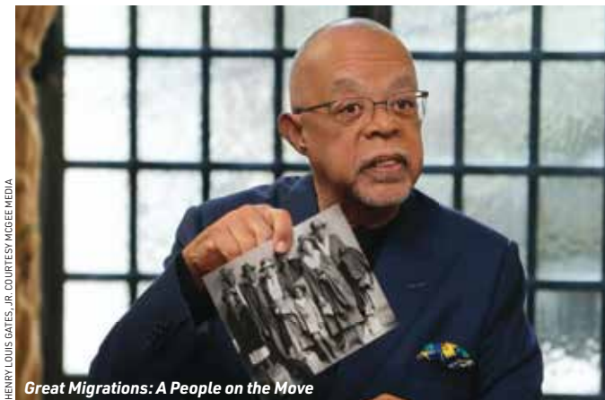
HENRY LOUIS GATES, JR.