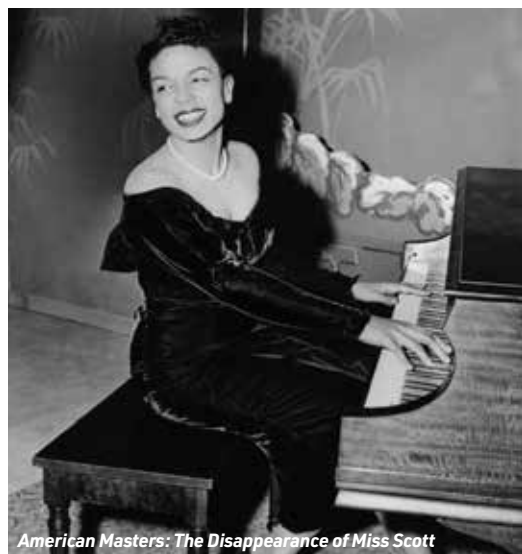
American Masters: The Disappearance of Miss Scott