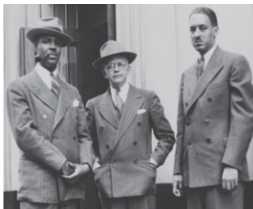
L-R: Roy Wilkins, Walter White and Thurgood Marshall, 1940s.

A new, two-hour American Experience documentary tells the story of Walter White (1893-1955), longtime leader of the National Association for the Advancement of Colored People — and of others who shaped America's most powerful civil rights organization. Under White's leadership, the NAACP paved the way for Black power at the ballot box and scored important legal victories. Braving violence and oppression in the Jim Crow era, NAACP activists set the stage for the Civil Rights Movement. Some of their names are familiar: W.E.B. Du Bois and Thurgood Marshall. But Walter White — arguably the most influential Black man in mid-century America — has been all but forgotten. Forgotten Hero: Walter White and the NAACP traces the life of this civil rights hero.