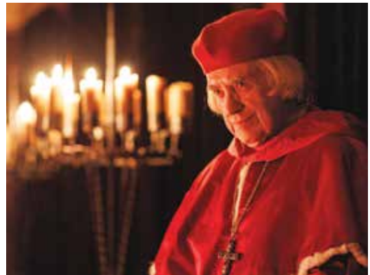
Jonathan Pryce is Cardinal Wolsey

Stream the series via the PBS App, or binge-watch with WETA Passport as of the March 23 broadcast premiere.