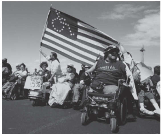
PROTEST IN LAS VEGAS

Tuesday, March 25 at 9 p.m. on WETA PBS & WETA Metro American Experience: Change, Not Charity: The Americans with Disabilities Act chronicles the decades-long push for equality and accessibility that culminated in passage of the ADA in 1990.