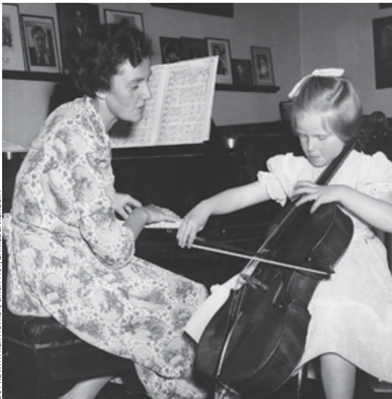
DU PRÉ WITH HER MOTHER, CIRCA 1951. DANIEL BARENBOIM

Friday, March 28 at 9 p.m. on WETA PBS & WETA Metro Jacqueline du Pré: Genius and Tragedy shares the story of the famed cellist, considered one of the 20th century's greatest. The film features concert performances, candid moments and more.