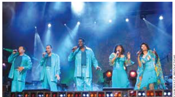
The Fifth Dimension