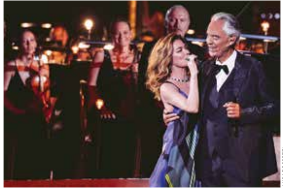
Andrea Bocelli performs with Shania Twain

S ince winning the “newcomers” section of the prestigious Sanremo Music Festival in 1994, Andrea Bocelli has gone on to become one of the most successful classical crossover artists in popular music. On the 30th anniversary of the world-renowned Italian tenor’s singular music career, a once-in-a-lifetime gathering of global superstars in Tuscany showcases Bocelli’s beloved repertoire through the decades. Jon Batiste, Sofia Carson, Lang Lang, Ed Sheeran, Shania Twain, Sofia Vergara, David Foster, Katharine McPhee, Will Smith and others are among the guests participating in a visually spectacular concert from the Teatro del Silenzio in Bocelli’s hometown. The program repeats March 9 at noon on WETA PBS.