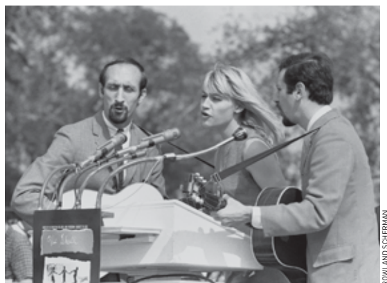
Peter, Paul and Mary perform at the 1963 March on Washington

M arking the January passing of trio member Peter Yarrow, WETA reprises a special documentary that spotlights the folk ensemble’s artistic legacy and social impact. The program features rare television footage, including a BBC production from the early 1960s that showcases many of the group’s best performances and most popular songs at the peak of its artistry, a time when the popular and influential trio dominated the Billboard music charts. From the group’s emergence in Greenwich Village, to its role in the Civil Rights and Anti-War movements of the 1960s, through later decades of advocacy and music, and its ongoing inspiration to fans, this deep exploration reveals Peter, Paul and Mary’s impact on their generation and the world. The film repeats March 7, 8:30 p.m. on WETA PBS.