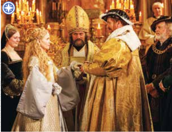
Kate Phillips portrays Jane Seymour; Damian Lewis is Henry VIII

Star-studded historical drama premieres March 23 at 9 p.m. on WETA PBS & WETA Metro