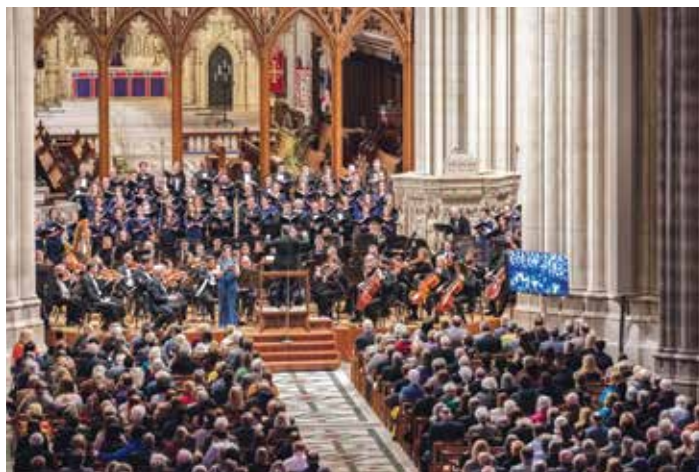
The Baltimore Symphony Orchestra and Cathedral Choral Society

Cathedral Choral Society joins forces with the Clarion Choir and the Baltimore Symphony Orchestra to perform Smyth’s Mass in D — a grand mass in the late Victorian-Romantic style — on Sunday, March 16 at Washington National Cathedral. Listen to Classical Breakdown to learn more about this extraordinary composer. In March, also visit WETA Classical’s blog at classicalscore.org for embedded Classical Breakdown episodes spotlighting women in classical music; and enjoy music by women composers throughout the month on WETA Classical.